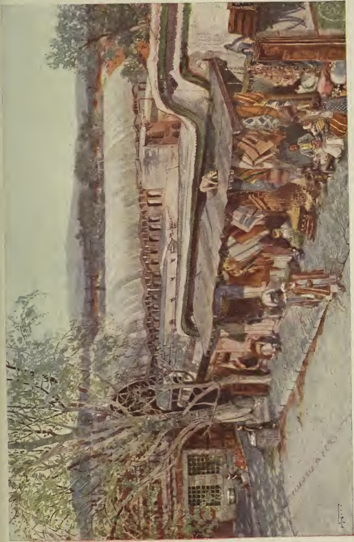
A Small Bazaar in Damascus.